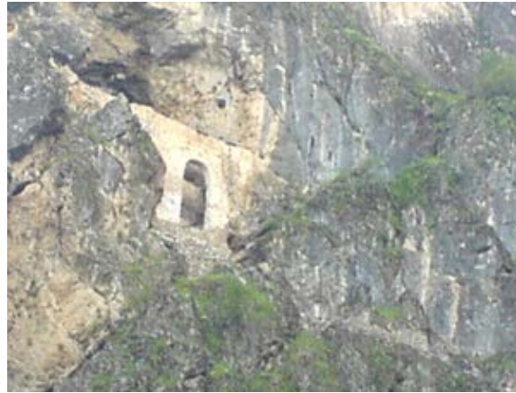
Sacred shrines in the mountains