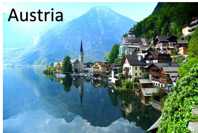
Figure 1 copy writes reserved