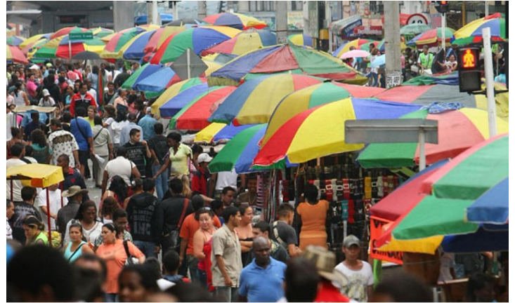
Image 1: Cali city, two place very close, but with different occupation.